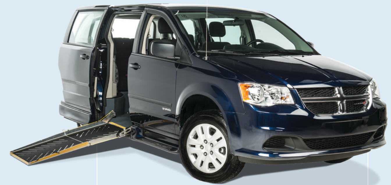
DODGE CARAVAN – Full Floor

NOTE: Only front wheel drive and non-hybrid models can be converted