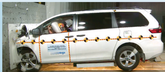
1 Consult Savaria for full details

Savaria is Canada's leading manufacturer of lowered floor accessible minivans. Built on today's most popular OEM platforms, Savaria conversions are offered for the Dodge and Chrysler Caravans, Chrysler Pacifica and Toyota Sienna. Our side entry conversions are built in Quebec with durable, weather-tough materials including stainless steel flooring.