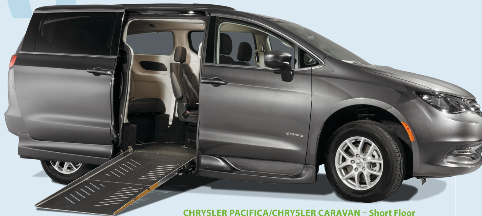
CHRYSLER PACIFICA/CHRYSLER CARAVAN – Short Floor

Savaria side entry van designs are crash-tested and meet national standards for safety (CMVSS). We sell conversions on new vehicles through dealers across Canada and we are also pleased to convert pre-owned 1 vehicles. Our full floor conversions feature a lowered floor into the front row seating area, ideal for wheelchair drivers, or front row wheelchair passengers. Savaria short floor conversions offer a lowered floor in the centre of the vehicle, ideal for families where the wheelchair passenger rides in the middle of the van. An authorized Savaria dealer can assist you to find the best solution for your needs.