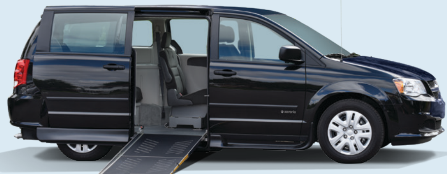
DODGE CARAVAN – Short Floor

Our popular full floor conversion built for the previous model Dodge Grand Caravan is ideal for wheelchair drivers. The bi-folding side ramp allows easy access with a 56" door height option available. Removable seating adds flexibility and the van can be configured with a power ramp and power kneeling.