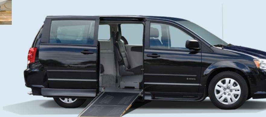
DODGE CARAVAN – Short Floor

Savaria side entry van designs are crash-tested and meet national standards for safety (CMVSS). We sell conversions on new vehicles through dealers across Canada and we are also pleased to convert pre-owned 1 vehicles. Our full floor conversions feature a lowered floor into the front row seating area, ideal for wheelchair drivers, or front row wheelchair passengers. Savaria short floor conversions offer a lowered floor in the centre of the vehicle, ideal for families where the wheelchair passenger rides in the middle of the van. An authorized Savaria dealer can assist you to find the best solution for your needs.